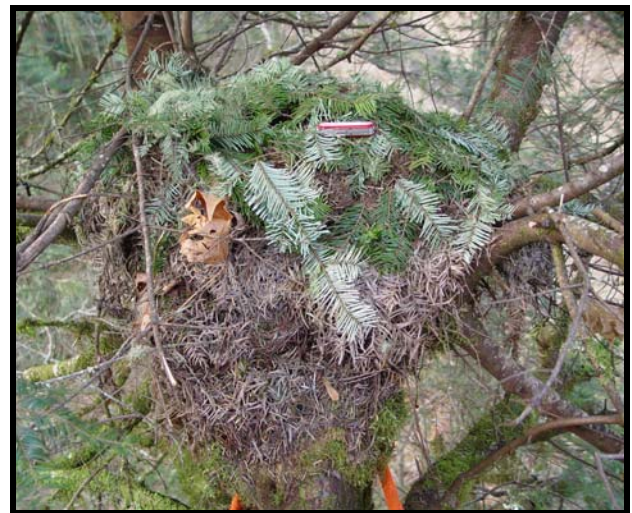
FIGURE 1. Nest of an adult female Red Tree Vole ( Arborimus longicaudus ) in the deformed top of a Grand Fir ( Abies grandis ) in a mixed forest of Douglas Fir ( Pseudotsuga menziesii ) and Grand Fir. This nest was occupied by at least two Clouded Salamanders ( Aneides ferreus ). Scale indicated by the 8 cm pocket knife.

of earlier biologists who had studied Tree Voles to determine if there were additional records of amphibians in Tree Vole nests. We were surprised to find a fairly large number of records in which earlier researchers observed Aneides salamanders or Pacific Tree Frogs in Tree Vole nests. To our knowledge, none of these observations have been published, and the use of Tree Vole nests as microhabitats by amphibians in Douglas-fir forests is largely unknown. Herein, we describe our observations of amphibians in vole nests in western Oregon, and summarize the previously unpublished records of other researchers.