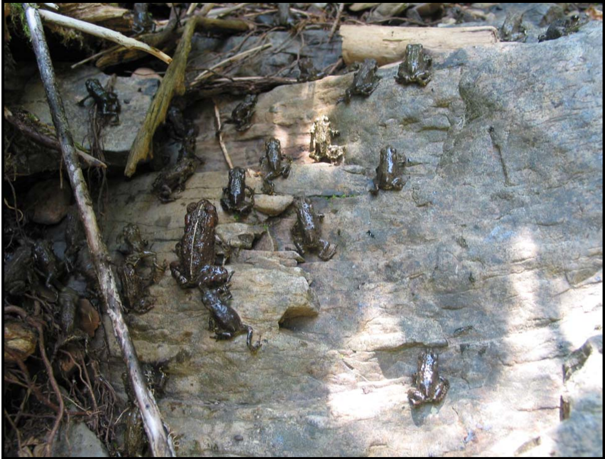
FIGURE 2. We distinguished juvenile (larger toad) Western Toads ( Bufo boreas ) from metamorphs on the basis of size.

Corporation, Hightstown, New Jersey, USA) with an accuracy of 0.1 mg. We estimated the mass of diet samples at 0.0001 mg if it was smaller than the detection limit of the electronic balance. Diet composition was defined as the percentage of items of a particular prey type out of the total number of dietary items.