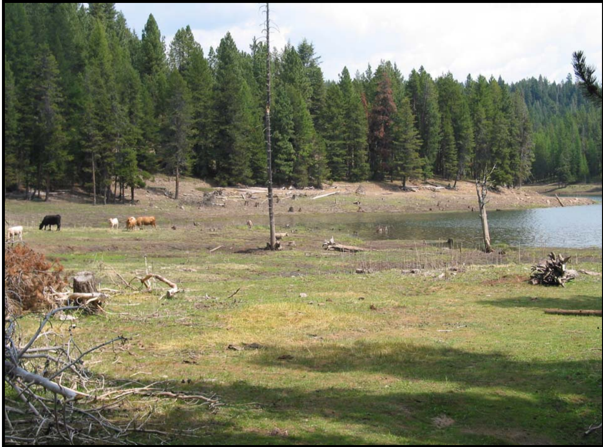
FIGURE 1. Primary breeding site of the Western Toad ( Bufo boreas ) at Balm Reservoir in northeastern Oregon, USA. Metamorphosed toads used the small drainage in the foreground for dispersal.

Diet Samples. —We collected diet samples from metamorphs at each of the three study areas in 2006 and at Balm in 2007. In August and September 2006, we collected 88 samples from metamorphs at the breeding sites or along streams within 1 km of the breeding sites. In July 2007, we collected 112 diet samples from metamorphs at Balm along two streams used for dispersal within 200 m of the breeding site. We compared these 2007 samples with available arthropods to determine selection of prey.