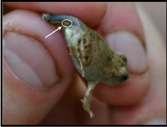
FIGURE 2. A live metamorphosing Spea multiplicata that was marked at the beginning of the study in the ventral tail membrane with a coded wire tag (indicated by arrow and oval).

I ended the experiment eight days after it began by removing every remaining tadpole from both mesocosms. I euthanized the tadpoles by immersion in a 0.1% aqueous solution of tricaine methanesulfonate and preserved them in 95% ethanol. I then checked each preserved tadpole for the presence of a CWT and measured each tadpole's SVL using digital calipers. In addition, I removed live metamorphic tadpoles from the mesocosms as they appeared during the course of the experiment (identified by the initial emergence of a front limb: Gosner stage 42; Gosner 1960). I maintained them in a plastic terrarium filled with dechlorinated water and a sand beach until they were released to their natal pond at the end of the experiment. As I removed each metamorphic tadpole from a mesocosm, I checked for the presence of a CWT and immediately measured SVL using digital calipers and mass (after removal of excess water) with a digital balance.