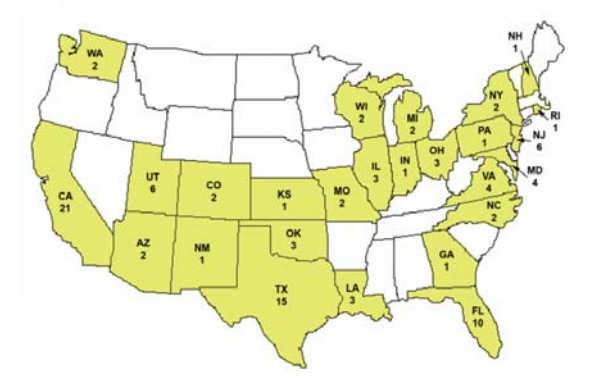
FIGURE 2. States in the USA where we detected dealers of amphibians and reptiles with commercial Internet sites. Not shown are 13 international dealers that were willing to sell and ship to customers in Texas, USA.

Informal visits to large chain pet stores revealed that the lizard is available through these venues which could account for their import in such large numbers. An