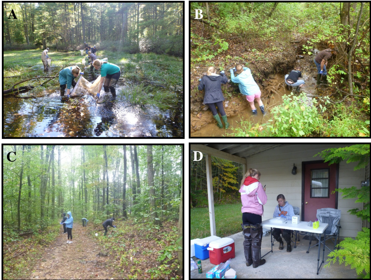
FIGURE 1. Field sample collection by students in an Amphibian Biology course at Bucknell University in (A) a pond, (B) a stream, and (C) a terrestrial habitat. D: A field sample collection station in which students organized the collected tissue samples and recorded data.

instead of skin swabs because recent studies suggest tissue samples may provide higher sensitivity in detection of Bd than cotton-tipped swabs (Davidson and Chambers 2011; Gratwicke et al. 2011). Whenever possible, we collected toe webbing from frogs because toe-webbing provide reliable tissue samples for Bd detection (Longcore et al. 2007). We also believed that removing toe webbing would be less invasive than removing toes. All toe clips and webbing were removed from animals by the professor of the class or the graduate student (MJW), who were issued the collecting permit by the Pennsylvania Fish and Boat Commission.